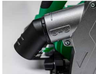
Clean working thanks to dustbag/vacuum connector.