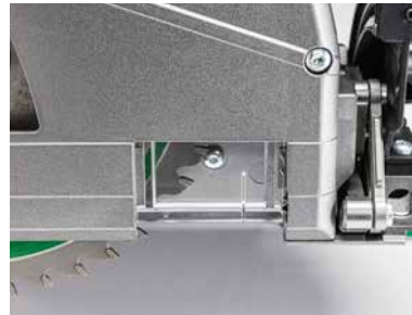
Inspection window for perfect view on the blade.

C3606DPA has a full package of features designed for precision and ease, making it highly versatile for various cutting tasks. Its flexibility and adaptability to different materials and scenarios render it invaluable for the professional.