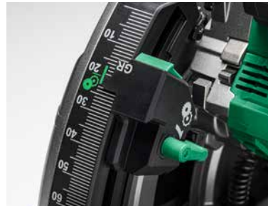
Double depth adjustment for accuracy with or without guide rails.