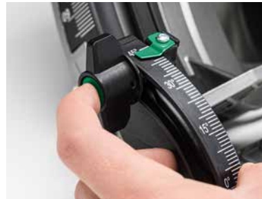
Undercut function (-1°/+46°) enables precise fitting cuts.